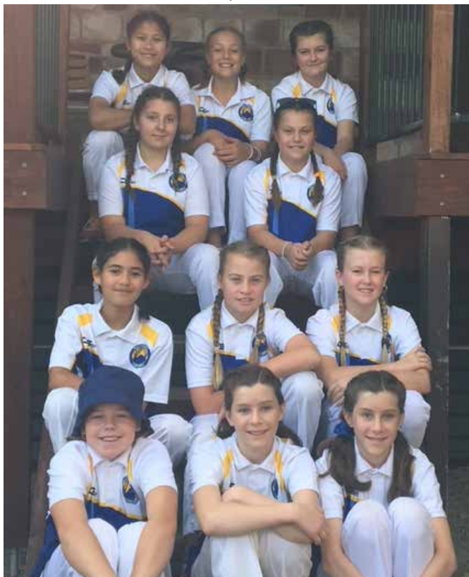
PSSA Girls Cricket Team