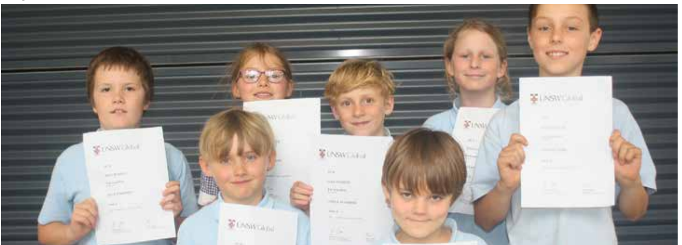
Congratulations for achieving great results in ICAS