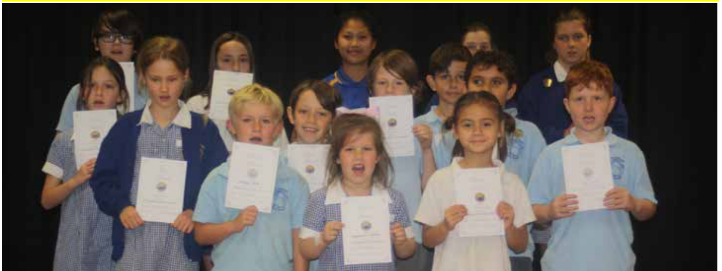
Congratulations to our Silver Award achievers